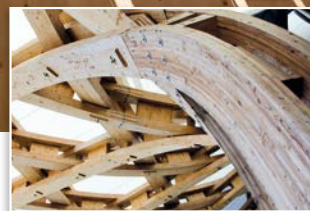
Surface and finger-joint bonding of wooden components, windows and door elements